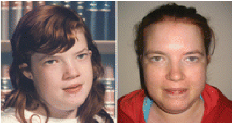
*Printed with permission

Kapadia et al, (2008) CMAJ ; 178 (4): 391-93